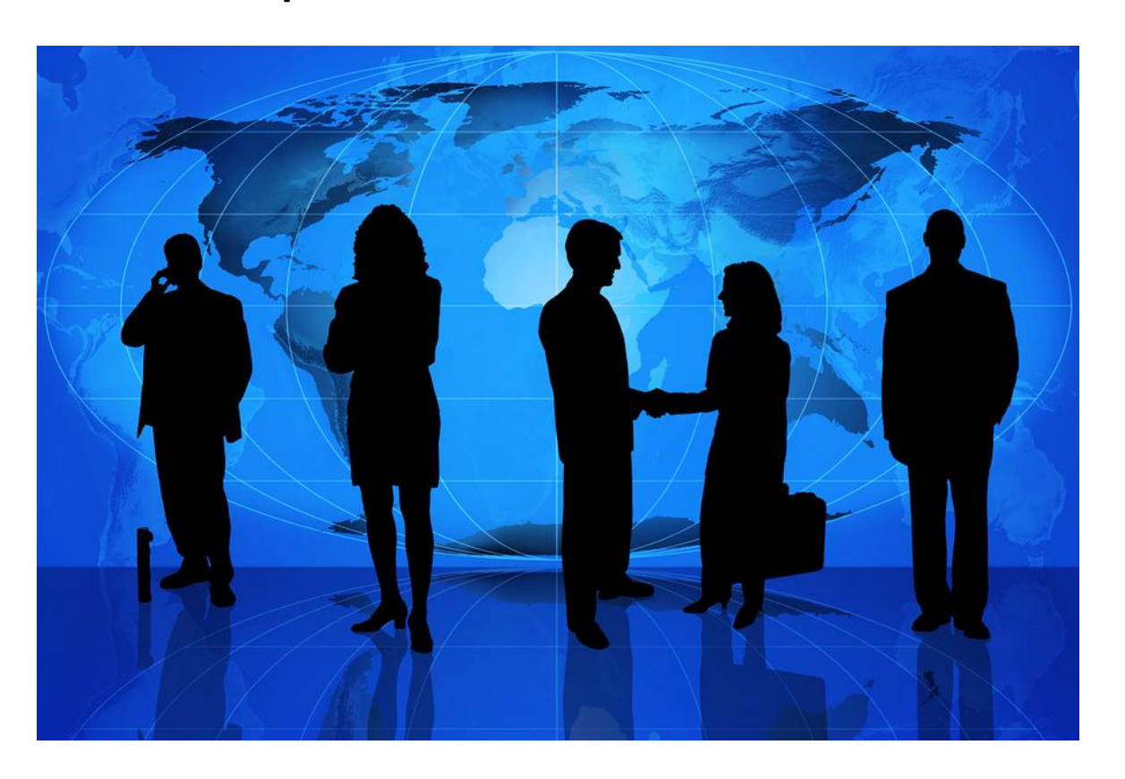
BFU: Capitalism and Investment